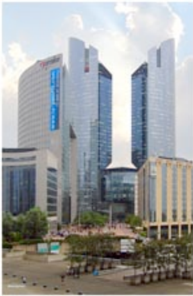
Baldan spa - Parigi 80's

External facade tower le Levant, Defense in collaboration with Bouygues s.a.