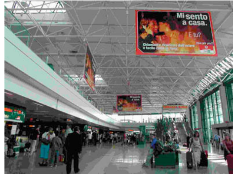
Baldan spa 1996-97. Extension Leonardo da Vinci Roma airport. External facade and cover