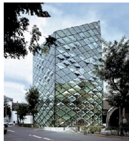
Baldan spa – 80's. External facade in collaboration with Gartner.gMBh