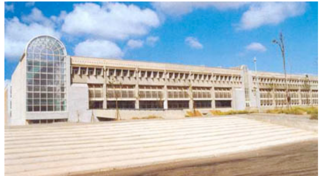
Baldan spa - 1993-94. Cagliari University. External facade