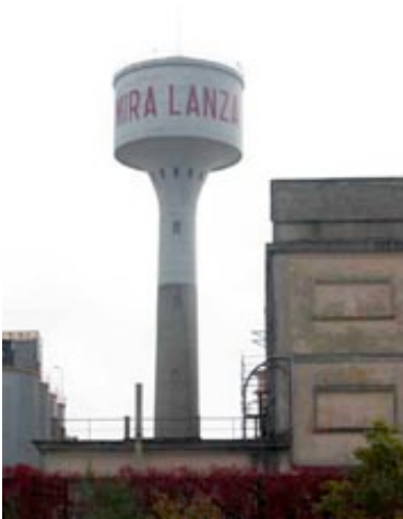
Industrial restructuring, design and propedeutic production step Mira Lanza di Pontinia (Latina), 1998