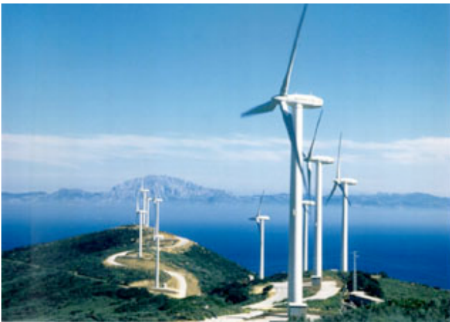
Veneta energia srl – 2004-2006

External facade tower le Levant, Defense in collaboration with Bouygues s.a.